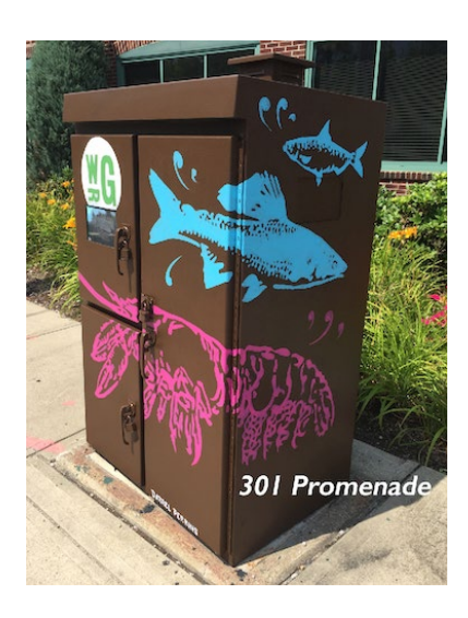
Signature WRWC electric box murals marking the way to the evolving Greenway.