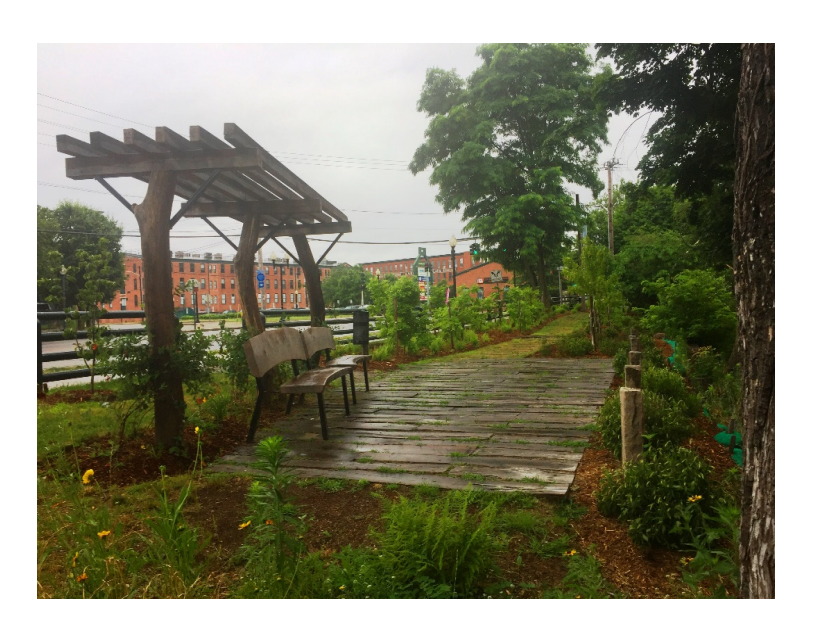
Pocket Park on Corner of Eagle and Kinsley Ave. WRWC's first pilot project showing the possibility of what is to come along Promenade & Kinsley.