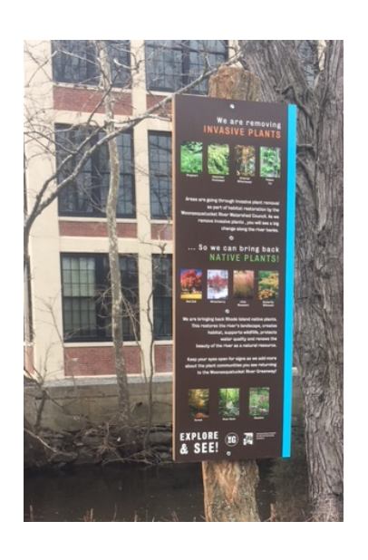
Signature WRWC Habitat Restoration Signage showing up along Promenade & Kinsley.