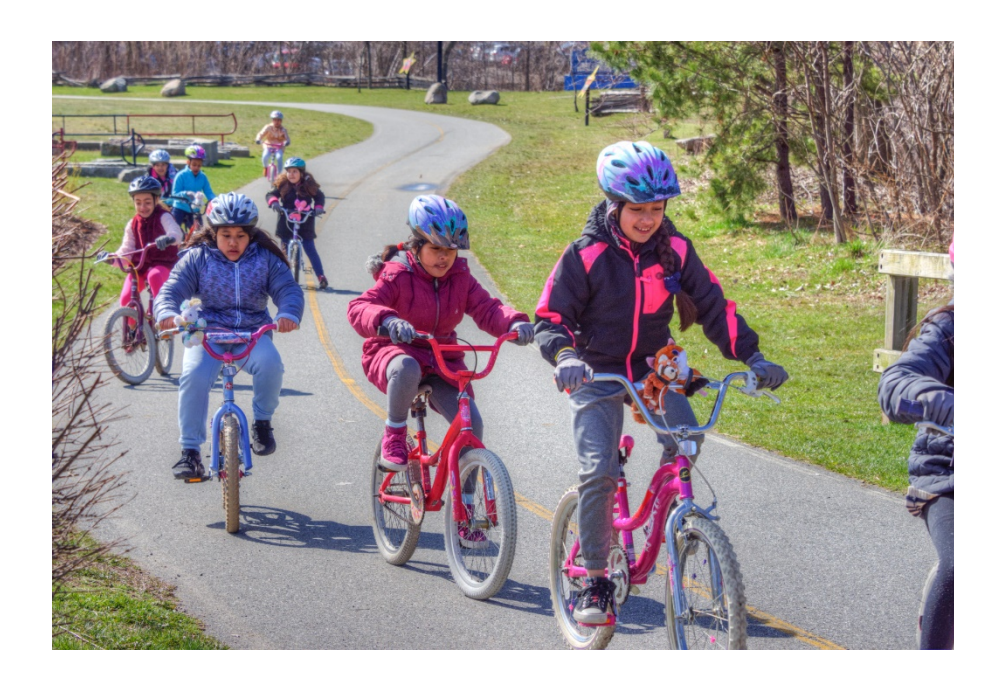
2018 Spring Girls Bike Camp with our friends from Manton Avenue Project in Olneyville. They're the faces of why safe, accessible bike paths are worth it!