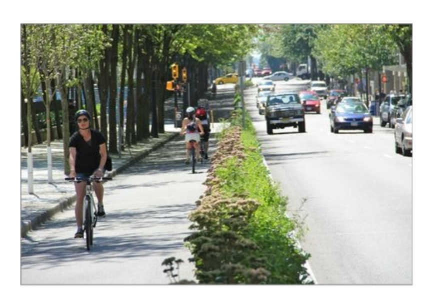
Sample image of what a protected bike lane using green infrastructure could look like.